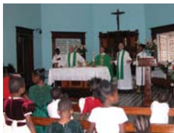
Liturgy at St. Anne's Church in Jamaica