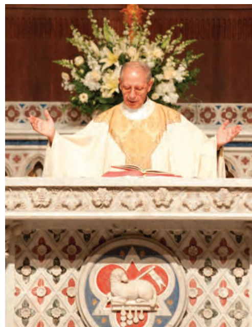
Father General Adolfo Nicolás, SJ, celebrated liturgy at Fordham University Church.