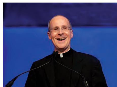
Fr. James Martin, SJ, author and editor at America magazine, served as master of ceremonies.